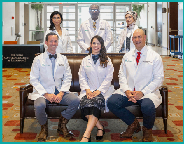
In celebration of our 2025 graduates

DHR Health celebrated a significant milestone on June 15, 2024 with its inaugural Graduate Medical Education (GME) Graduation ceremony , honoring six graduates from the fields of Internal Medicine, General Surgery, and Surgical Critical Care .